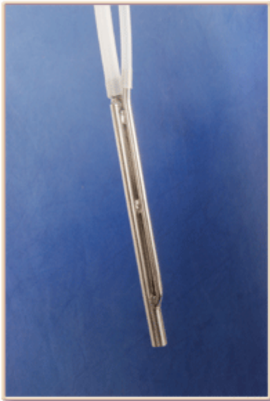
3/4 Inch Pump