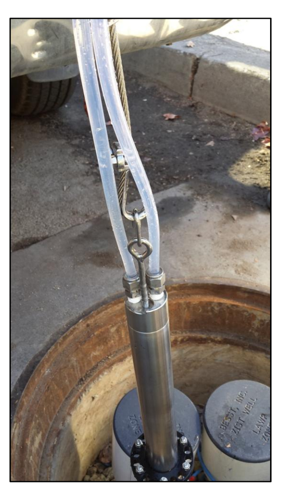
Figure 2- Stainless Steel Panacea P200 being deployed into a nested monitoring well in North Hollywood, CA. Tubing is 3/8" OD FEP bundled with 3/16" stainless steel support cable. The docking cage is located at the bottom of the photo.

Alternatively, BESST also offers customized Inline transducer integration options so that a transducer can be housed in the isolated section of the well and record pressure and temperature data based on the water from the formation, and not the static water in the casing.