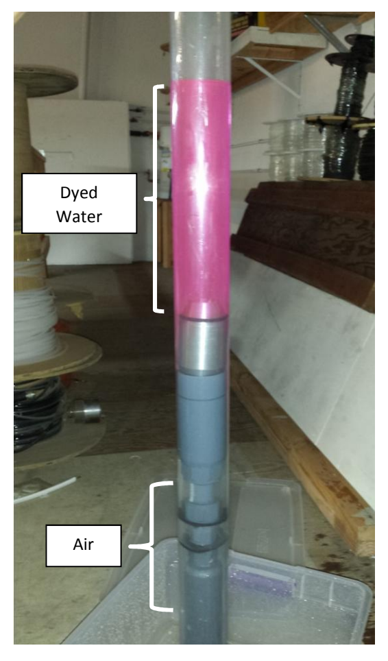
Figure 2- Rhodamine dye showing the seal of a 2" Retro ZIST system in a clear PVC pipe. NOTE: The space beneath the flanges is not filled with water, but with air, representing a high pressure differential.

Water level measurements are simply accommodated. The pump is lifted up a few inches off the docking station allowing groundwater within the well screen to communicate with the atmosphere and adjust to hydrostatic pressure over time. The tubing slack (from the slightly lifted pump) is attached via a tubing clip located on the underside of the well suspension cap. When the operator opens the well, the first task typically is to obtain a water level measurement. The pump is then reset into the conical docking station by lowering it a few inches until it seats – thereby allowing the well screen section to be purged and sampled.