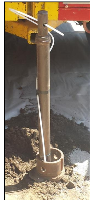
Figure 1 - Mini Probe deployed in hollow stem augur.