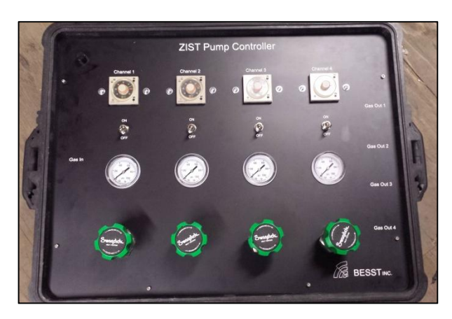
Figure 2- A 4-channel Timer Control Unit, used for nested or nearby wells