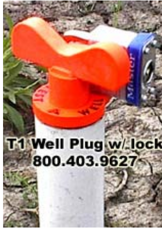
T1 - 1" Well Plug