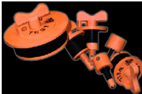
Well Plug Product Family