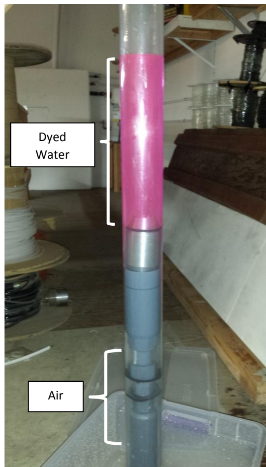
Figure 2- Rhodamine dye showing the seal of a 2" Retro ZIST system in a clear PVC pipe. NOTE: The space beneath the flanges is not filled with water, but with air, representing a high pressure differential.

Water level measurements are simply accommodated. The pump is lifted up a few inches off the docking station allowing groundwater within the well screen to communicate with the atmosphere and adjust to hydrostatic pressure over time. The tubing slack (from the slightly lifted pump) is attached via a tubing clip located on the underside of the well suspension cap. When the operator opens the well, the first task typically is to obtain a water level measurement. The pump is then reset into the conical docking station by lowering it a few inches until it seats – thereby allowing the well screen section to be purged and sampled.