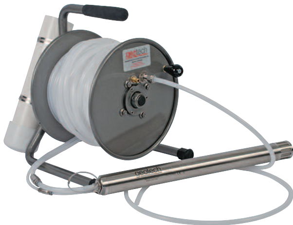
Portable Bladder Pump Reel System