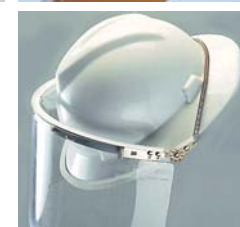
Metal Defender + Foldback Faceshield Frames (Bottom Left: Cap P/N 488160, Bottom Right: Hat P/N 488159)