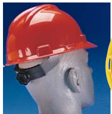
Fas-Trac® Suspension System