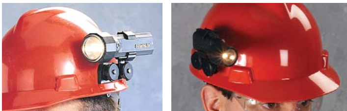
Stealthlite & Light Holder for Slotted Caps VersaBrite II Light

MSA offers three helmet lights that fit into our special cap or hat adapters. All of the lights are FM and CSA-approved for intrinsic safety, and are non-incendive.