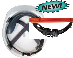
1-Touch™ Suspension System