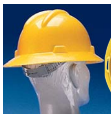
Staz-On® Suspension System