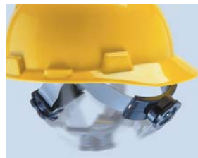
Swing-Ratchet Suspension System