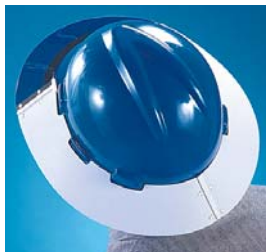
V-Gard and Advance Sun Shield