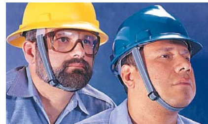
Chinstrap (attaches to suspension)