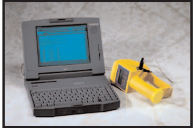
Computer interface is a standard feature of the PortaSens II. An RS-232 output allows stored data to be downloaded to a PC through an interface cable supplied with the unit. Software is provided to allow simple data transfer.

Sensors used in the PortaSens II are ATI's newest miniaturized smart sensor modules. Each sensor module is actually a sensor, amplifier, and memory module in one compact package. Because of this design, sensor modules can be calibrated independently and simply plugged into any detector for immediate use. When installed in a detector, calibration data is loaded into the microprocessor so that no adjustments are needed. The result is that a detector can, for example, go from phosgene measurement to ammonia measurement in less than one minute.