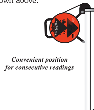
Convenient position for consecutive readings