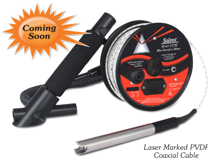
Laser Marked PVDF Coaxial Cable