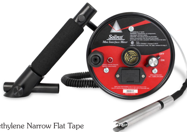
Narrow Polyethylene Flat Tape