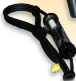
CA-6010 Single gas monitor ideal for residential inspection businesses.