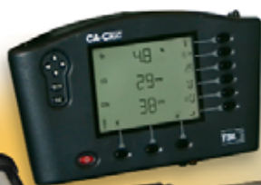
CA-6203 The commercial/light industrial analyzer ideal for measuring NO x . Three-line display.