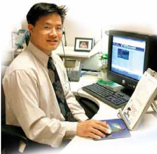
Fast and friendly customer support.