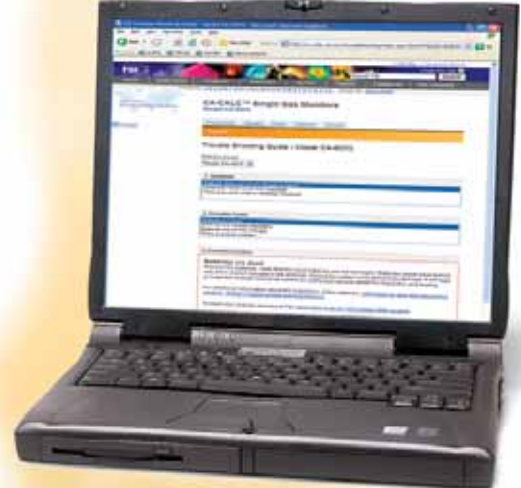
Convenient on-line diagnostics.