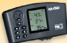
CA-6140 The best all-around residential/light commercial analyzer available. Three-line display.