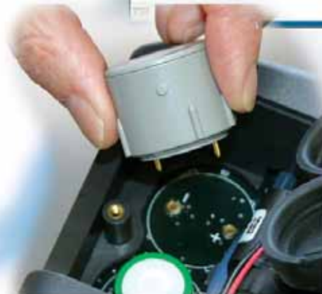
Install pre-calibrated sensors in just minutes.