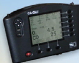
CA-6213 Excellent industrial analyzer for total performance and low NO x output. All data on one screen.