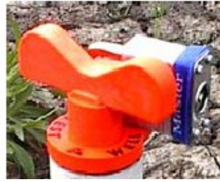
T1 - 1" Well Plug