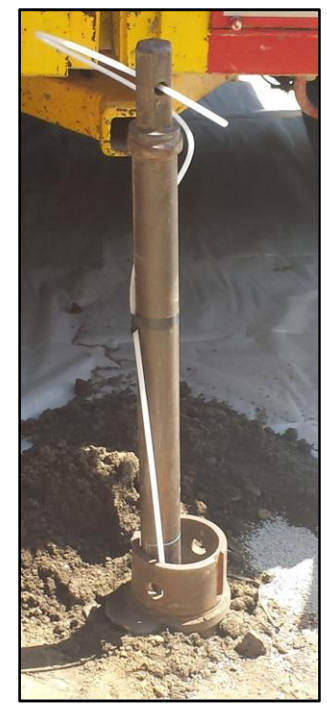
Figure 1 - Mini Probe deployed in hollow stem augur.