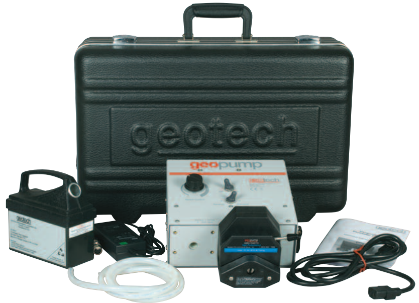
Geopump™ Peristaltic Pump Series II Kit with optional easy-load II® pump head, modular battery, 5 ft. (1.5 m) tubing, carrying case and power cord