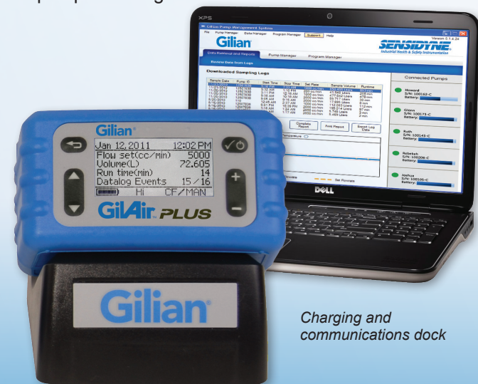
Charging and communications dock

The GilAir Plus dock provides charging and communication functions for the STP and data-logging models. Once docked, the PC application allows users to review datalogs, generate sampling reports, manage sampling programs, and create pump set-up profiles that expedite deployment of large pump fleets. The SmartCal SM feature uses the dock as a communication link between appropriate calibration devices and the GilAir Plus. SmartCal SM automates calibration and records pre and post sample calibrations in the pump's datalog.