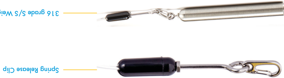
Figure 1 Spring Release System with accessories