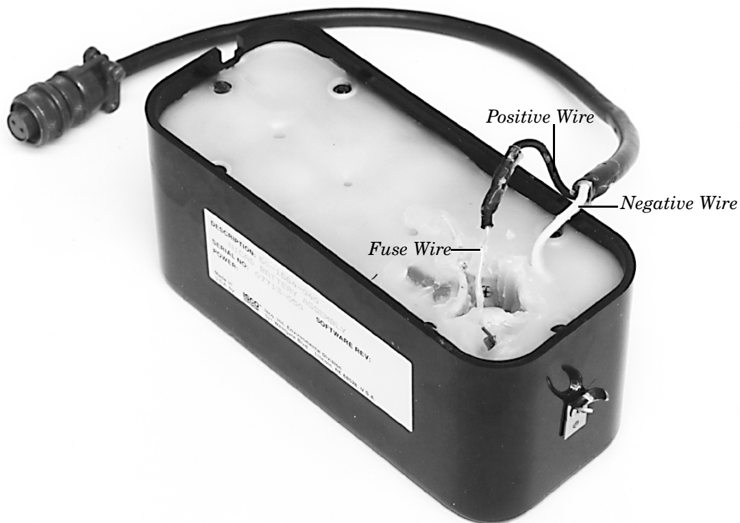
Figure 3-1 Nickel-Cadmium Battery Pack Fuse Replacement