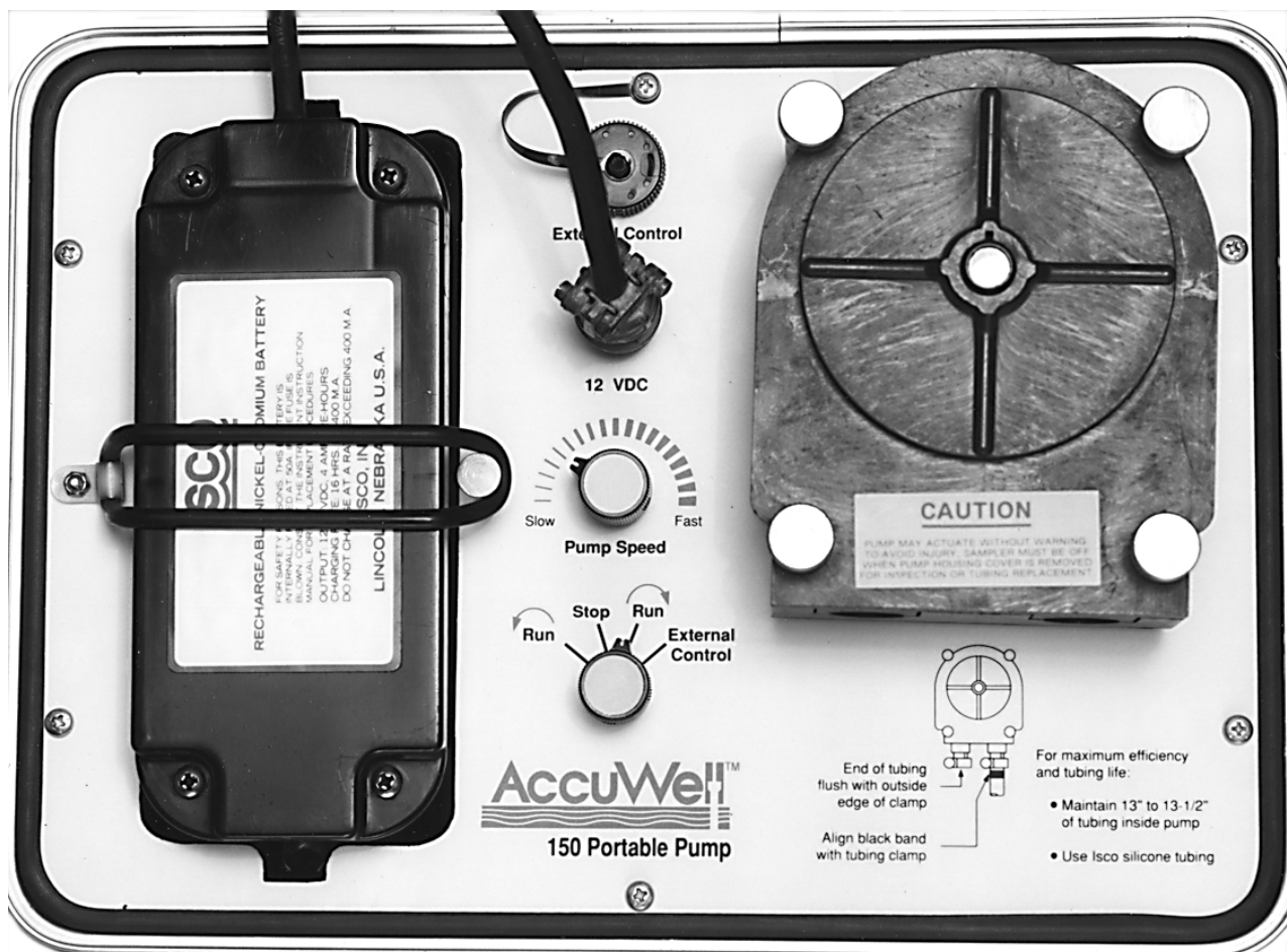
Figure 1-1 Portable Pump Control Panel

The technical specifications of the Portable Pump are listed in Table 1-3.