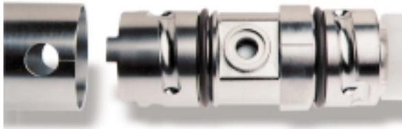
Innovative design and precision machining make the pumps reliable and easy to disassemble.

Sample Pro Pumps are not only able to deliver consistent low-flow rates, they are easy to disassemble without tools, simple to clean, and truly field rugged.